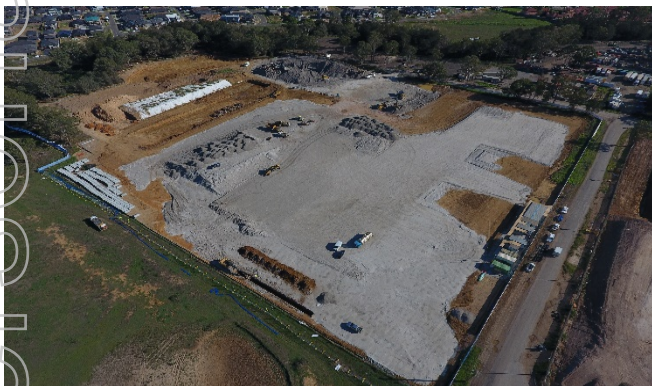
PURT5: Prestons site as at 30 April 2018

PURT5: Prestons – Construction works have commenced and are progressing well as can be seen in the picture below.